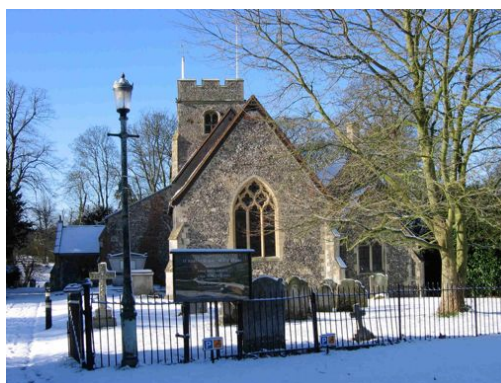
A view of St. Mary's Church, North Mymms

The top two locations identified in response to the question, “What is your favourite part of the Parish?”