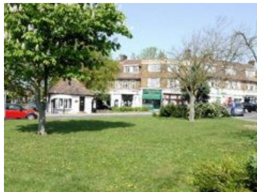
Views of Bradmore Green, Brookmans Park